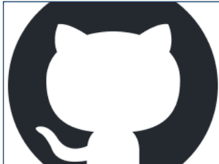
Repository for proof of conc...